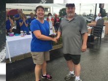
2016 Best of Show Winner